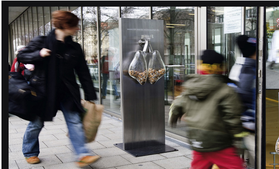
Body Copy above glass lung: Website URL for The AOK (Germany’s largest health insurance company)