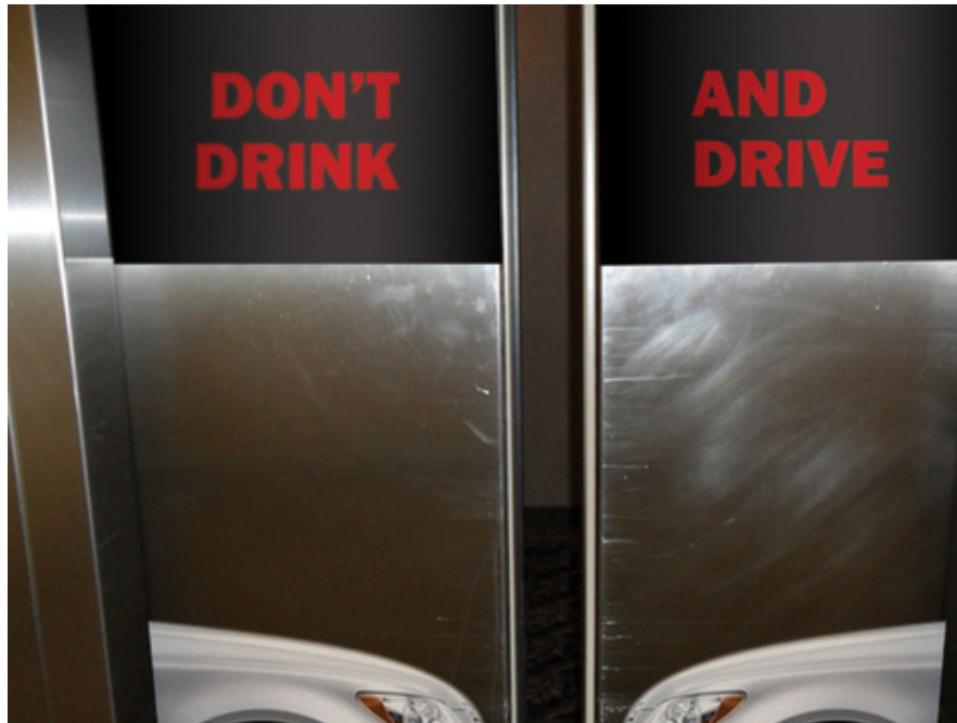
MADD: Mothers Against Drunk Driving Headline: Don't Drink and Drive